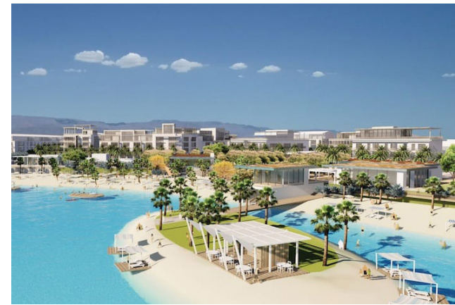
GRAND OASIS CRYSTAL LAGOON