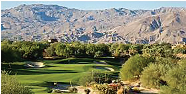
DESERT WILLOW GOLF COURSE