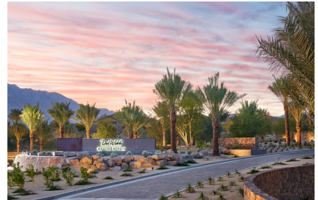
DEL WEBB AT RANCHO MIRAGE